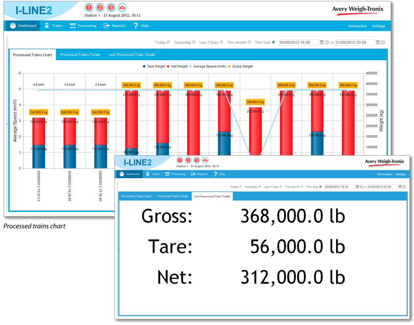
Last processed train data

All measurements are retained within the system and can be archived for data storage efficiency.