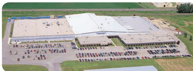
Avery Weigh-Tronix manufacturing facility – Fairmont, MN

Avery Weigh-Tronix has been an active force in advancing the state of scale design since 1813. Its products are recognized for durability that exceeds general industry standards and performance that reflects the latest advances in technology. Through customer satisfaction, Avery Weigh-Tronix has grown rapidly and is one of the world's largest manufacturers of commercial and industrial scales.