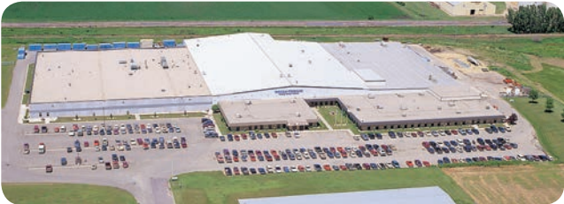
Avery Weigh-Tronix manufacturing facility – Fairmont, MN

Avery Weigh-Tronix has been an active force in advancing the state of scale design since 1813. Its products are recognized for durability that exceeds general industry standards and performance that reflects the latest advances in technology. Through customer satisfaction, Avery Weigh-Tronix has grown rapidly and is one of the world's largest manufacturers of commercial and industrial scales.