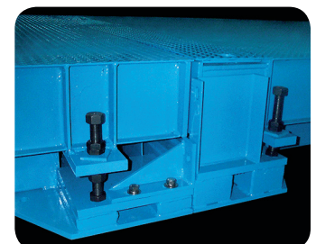
Installs on any stable surface – fast assembly and leveling.