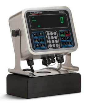
External Battery Pack

Facilitates wireless use, or provides backup in areas that might have a fluctuating power supply. The attachable pack uses D batteries with toggle on/off switch.