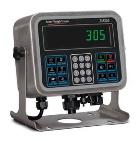
ZM305 STANDARD IP69K

This ZM305 offers all the functions of the ZM303 but with added power. It also supports in-motion weighing, making it an ideal solution for conveyor scales. Both ZM305 models can connect with up to 14 analog weight sensors and its higher excitation voltage makes it suitable for applications that require input from multiple weight sensors at a longer distance.