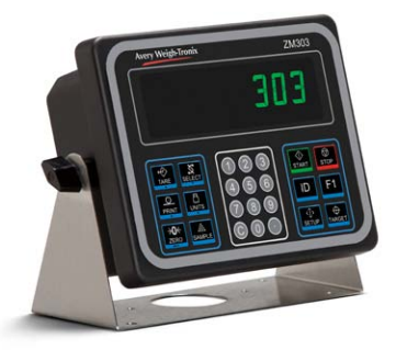
Tabletop Stand Kit For aluminum enclosure models.

Facilitates wireless use, or provides backup in areas that might have a fluctuating power supply. The attachable pack uses D batteries with toggle on/off switch.